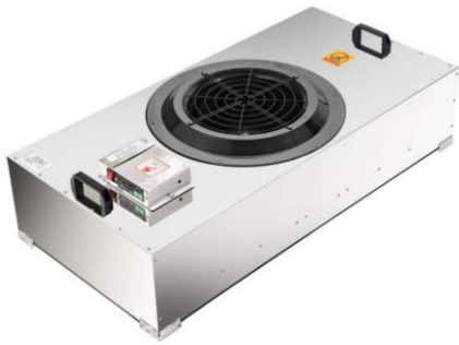
Stainless steel frame