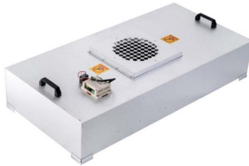
Galvanized steel frame