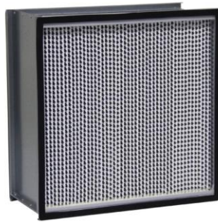
Double turn DTF