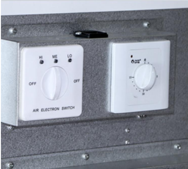
Speed Control, On/Off